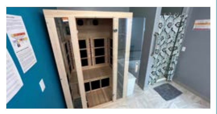
*Free sauna offer ends September 30, 2022

If you haven't tried it, mention this article and you can try it once for FREE!*